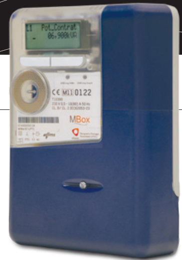
A SmartPower Product

By providing four quadrant operation together with specific functions M Box units can be deployed both in traditional households with one-way energy flow but also in integrated microgeneration applications with bidirectional flows.